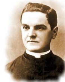
Father Michael J. McGivney